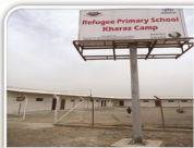
The new Refugee Primary School

Once the project was agreed upon, SHS immediately commenced with the aim of completing construction in time so the school could be used in the approaching school year. In July 2012 SHS finished building and furnished the school and all its classrooms, administration office, washrooms and the morning assembly yard.